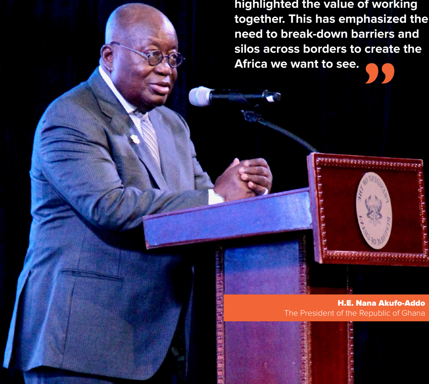
H.E. Nana Akufo-Addo