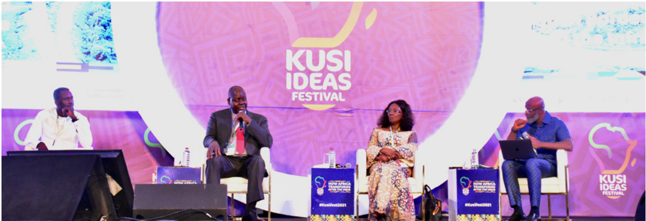
Prince Moses (right) moderates a panel discussing the challenges and opportunities in the development of Africa's infrastructure