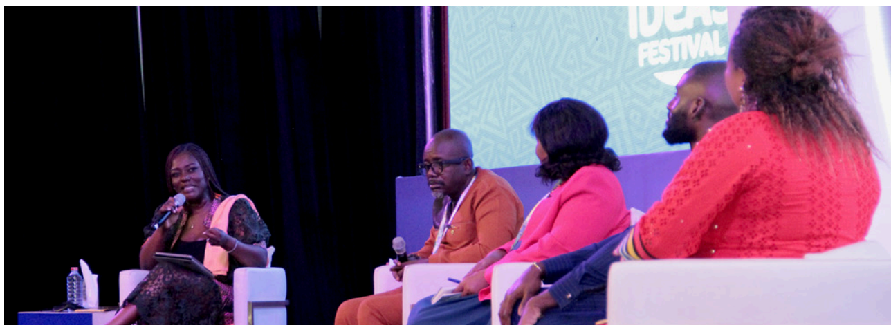
Panel of speakers from across the continent discuss the theme