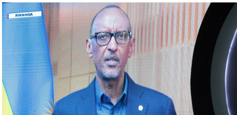
H.E. Paul Kagame, President of the Republic of Rwanda gives his remarks at the Kusi Ideas Festival III opening ceremony.

Please continue counting on Rwanda's support for this homegrown African initiative. I wish you a successful conference.