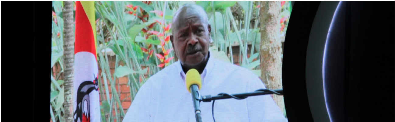
H.E. Yoweri Museveni, President of Uganda, gives his remarks virtually at the third edition of the Kusi Ideas Festival in Ghana

In Uganda, we have lost about 3,000 people since the start of the pandemic, with another 120,000 being affected by Covid-19, a majority of these being 50 years old or with pre-existing conditions.