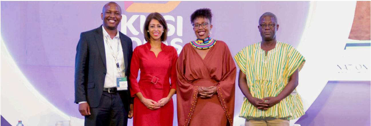
The members of the vaccine panel pose for a picture at the end of their session

“Something we can borrow from a country like Rwanda is using trusted bodies like local organisations, church leaders, or even private entities like bars and entertainment spots to drive vaccine uptake. [We’ve seen that] the turnout is much higher when the person calling you to get vaccinated is someone you trust.”